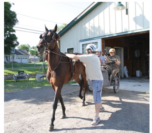
Driving School Race at the Goshen matinee on Sunday, June 15th.

Students that were considered advanced had the opportunity to go to the racetracks with their respective stables to paddock horses that were in-to-go. Other events for the school included a tour of Blue Chip Farms as well as the Harness Racing Museum and the opportunity to participate in the USTA