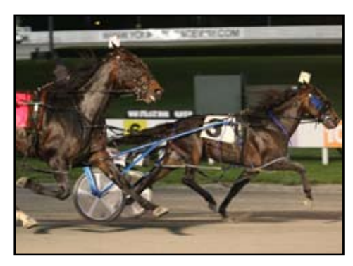
Night of Champions Bullville Powerful photos courtesy of Yonkers Raceway