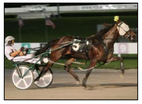
Night of Champions Hay Goodlooking

In 2008, the Sire Stakes Series had purses amounting to nearly $13 million and the State Fair Series had purses amounting to $1.1 million.