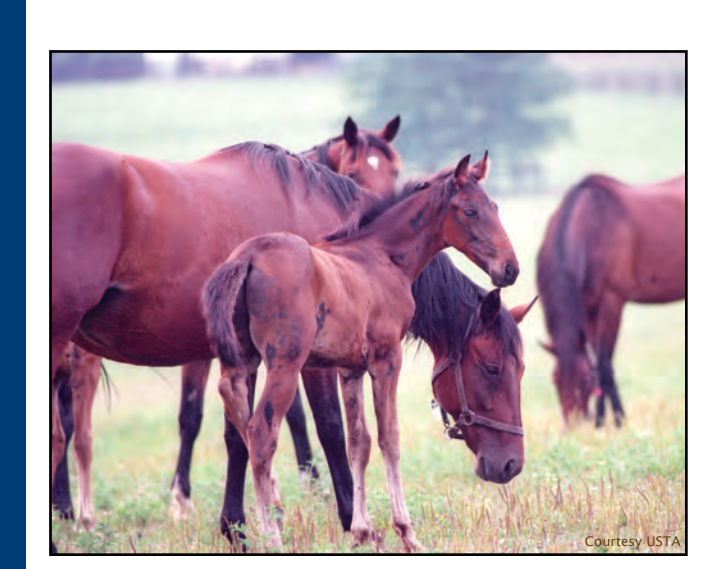
Agriculture is one of New York State's leading domestic industry and with a vast amount of open space and farmland, the state is an excellent choice for horse breeding.