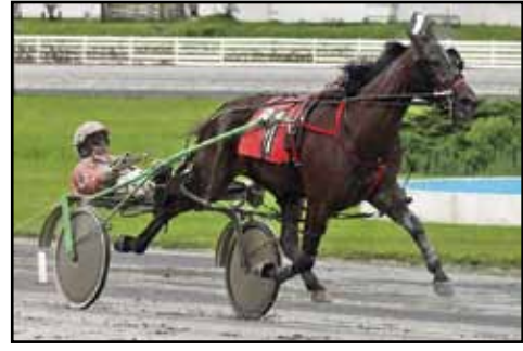
Anndrovette - 3 Year-Old Pacing Filly