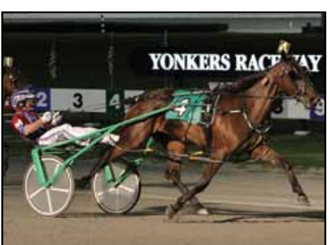
See you at Peelers - 2 Year-Old Pacing Filly