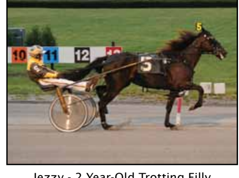
Jezzy - 2 Year-Old Trotting Filly