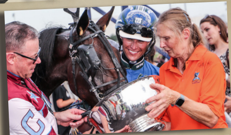
Cool Papa Bell