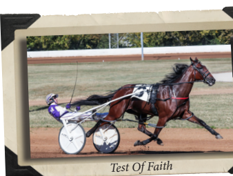
Test Of Faith

The success of these horses started with breeding to quality stallions standing in New York who annually are at or near the top of the leaderboard in North America. Horses like American Ideal ($17,225,526 total progeny earnings in 2022), Chapter Seven ($12,836,002), Roll with Joe ($6,949,107) and Huntsville ($6,527,898) have proven once again that breeding in New York today produces high caliber races horses for tomorrow.