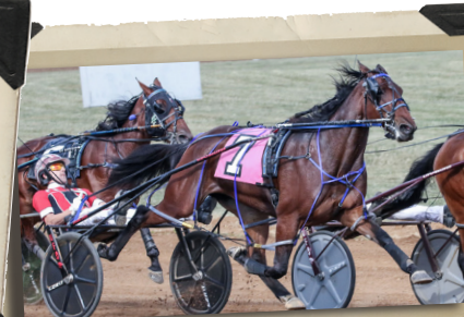
Twin B Joe Fresh