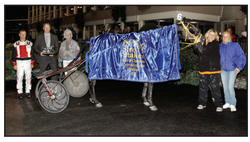
Mojo Terror WC - 3 Year-Old Pacing Colt