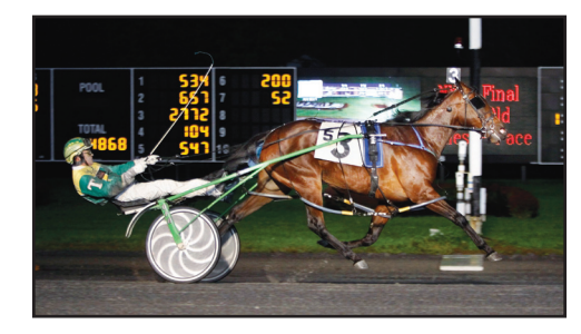
Handsoffmycookie - 2 Year-Old Pacing Filly